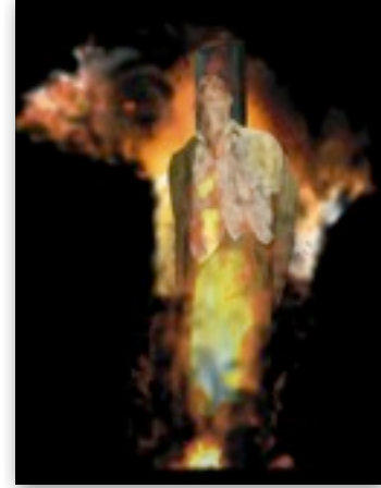
Tyndale was burned at the stake

doctrines that are taught in your Bible and mine. So as long as the people didn't know this, there were no problems, but they desperately feared the time, when the people would discover better. Martin Luther, the famous reformer, was also placed on trial by the church at the Diet of Worms, Germany. He was there found guilty and condemned to die. However, he escaped into the Protestant controlled portion of Germany and that sentence was never executed. Now remember this was written before any of this transpired. History only proves what Almighty